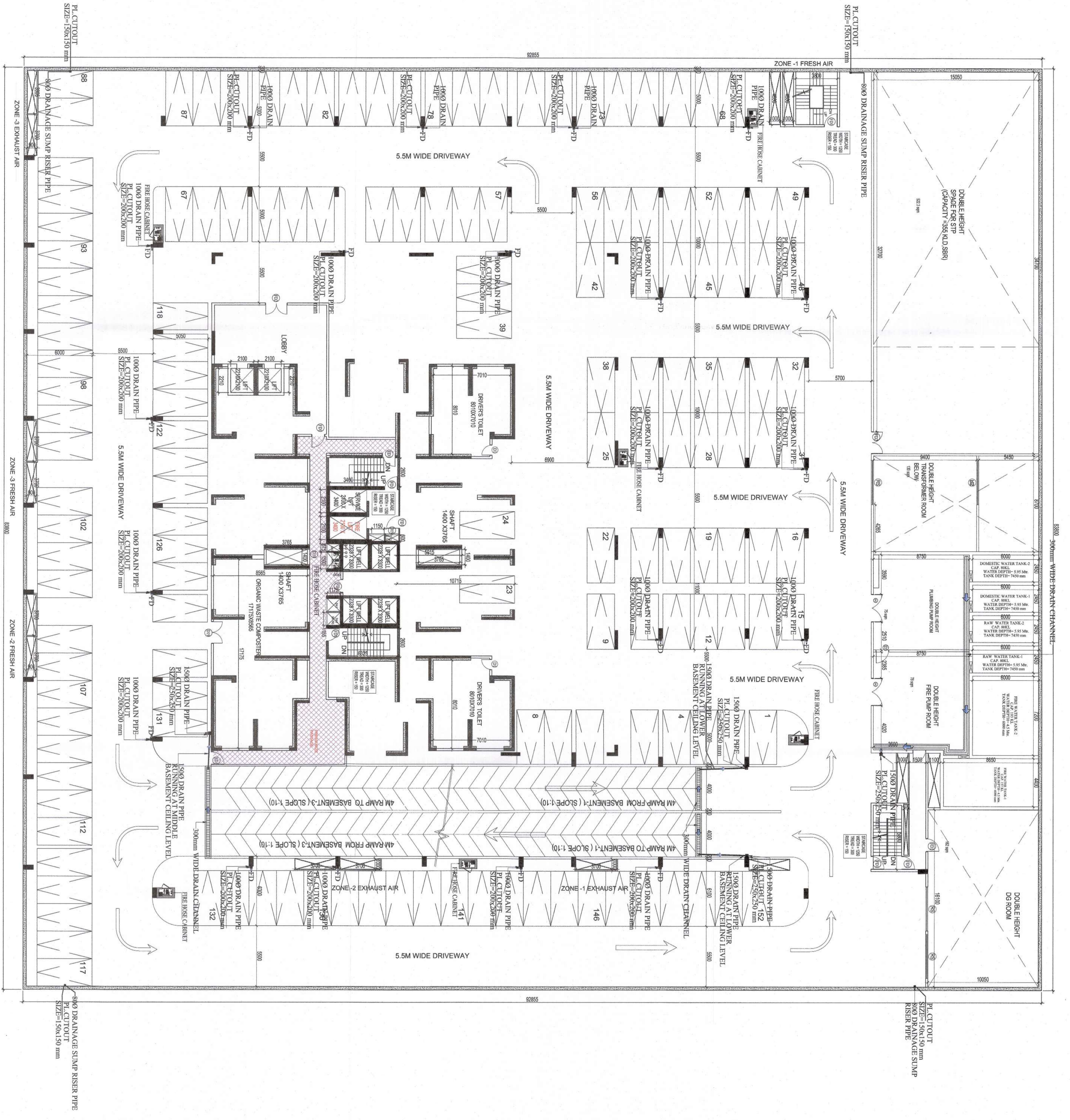
MIDDLE BASEMENT PLAN SCALE: 1:200

AREA CALCULATION FOR CAR PARKING OF BASEMENT-2:- TOTAL COVERED AREA OF BASEMENT-2 = 7702.75sqm TOTAL PARKING AREA OF BASEMENT-2 = 17702.75sqm (1224.942+6477.812+5000) PROVISION OF CAR PARKING = 6477.812/202 = 32.07 CARS PROPOSED CAR PARKING AT MIDDLE BASEMENT = 152 CARS PARKING AREA FOR 1 CAR = 2000 x 5000